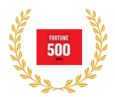
Ranked 137 In the Fortune India 500 list in 2021