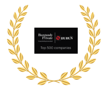
Top 5 Women Employers in India by Burgundy Private Hurun India 500, 2021