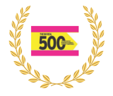
Ranked 100 In Business World real 500 in the non-financial sector