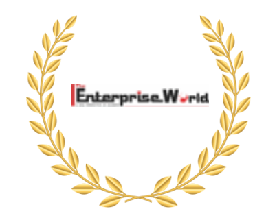
Among the Top 10 HR tech firms by The Enterprise World Magazine 2021