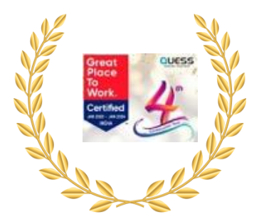
Certified a Great Place to Work in 2023 for the fourth consecutive year